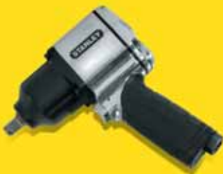
Square Drive Impact Wrench - 1/2"