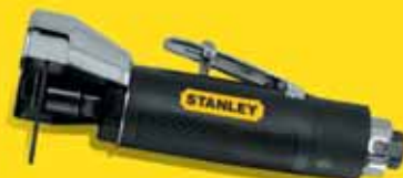
Cut Off Tool