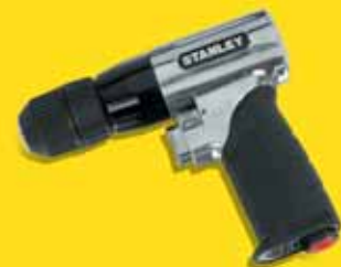
Drill - 3/8"